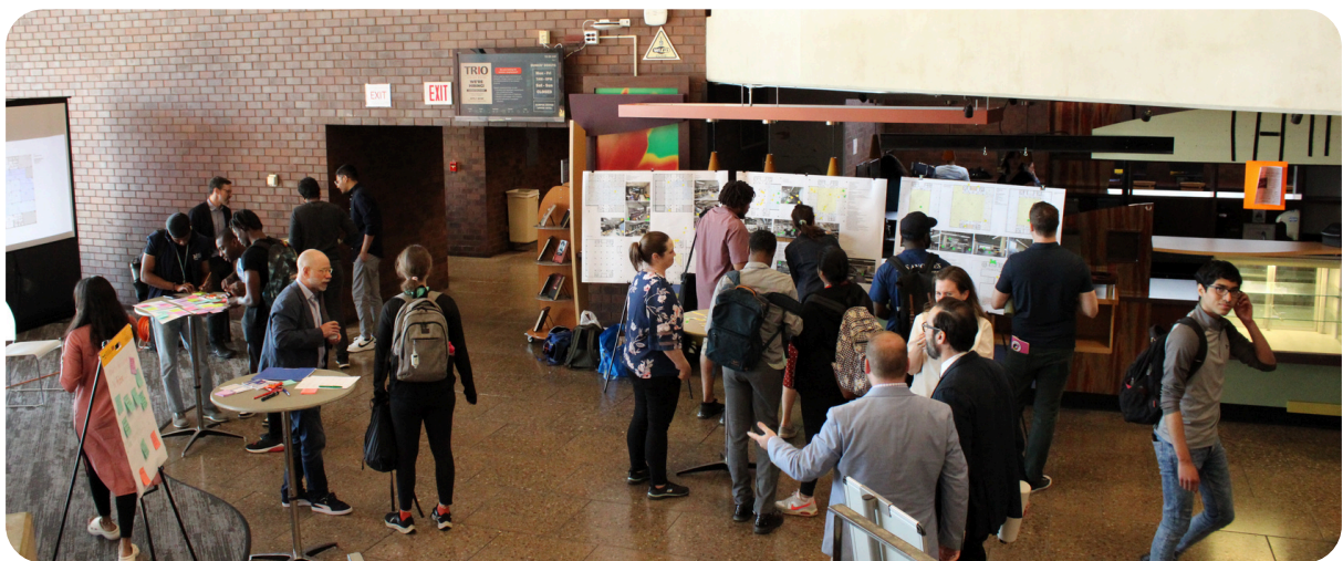
Attendees at an architectural open house in May 2024 provide feedback that will inform renovation plans for the Healey Library building.