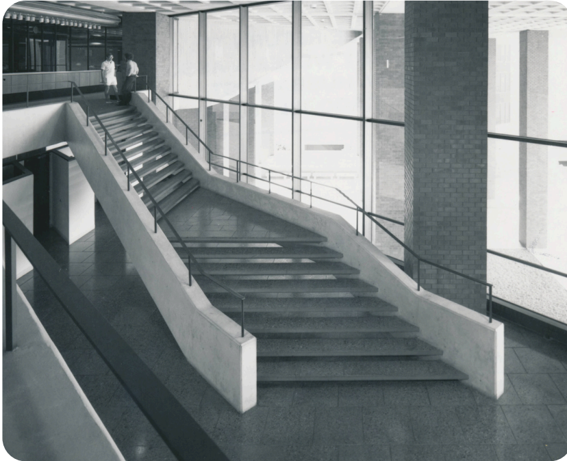
Healey Library's unconventional second floor staircase, representative of the original building's Brutalist architectural style ( ~1979)