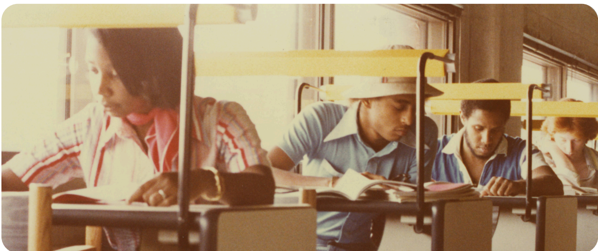
Students studying in Healey Library sometime in the 1970s or 1980s